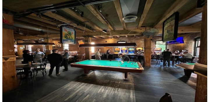
Summer Soiree, September 25, 2025

On September 25th the Denver chapter held its annual Summer Soiree at the Wynkoop Brewery in Downtown Denver. 20 members and non-members were in attendance.